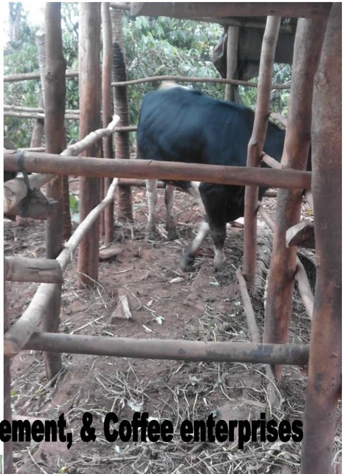
Maize, Bull for Breed improvement, & Coffee enterprises