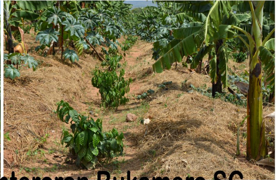
OWC Banana/Coffee Intercrop Bukomero SC