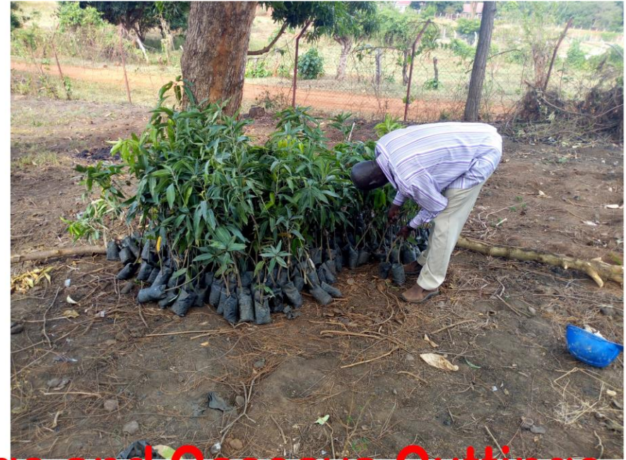
Delivered Mango seedlings and Cassava Cuttings