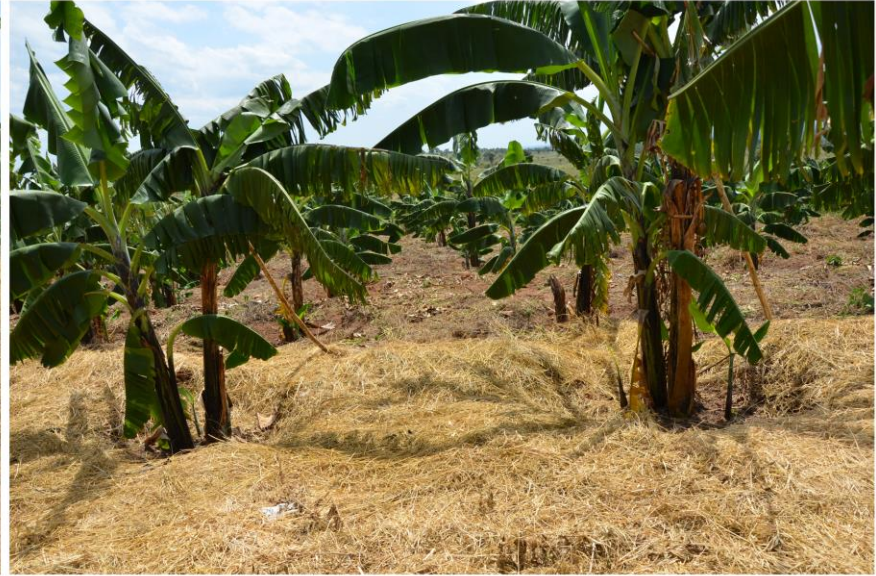
OWC Banana / Coffee Intercrop in Dwaniro S/C